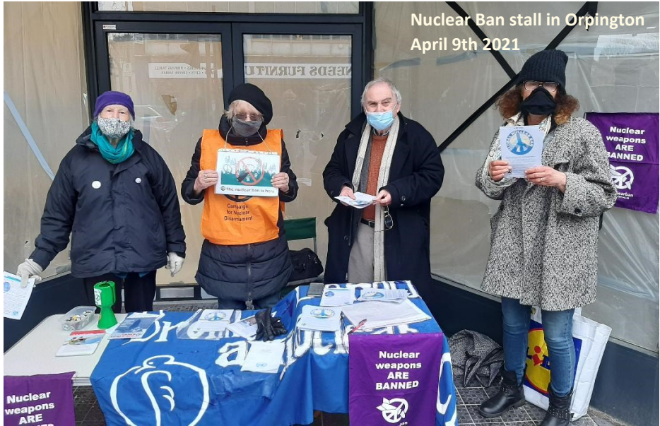
Nuclear Ban stall in Orpington April 9th 2021