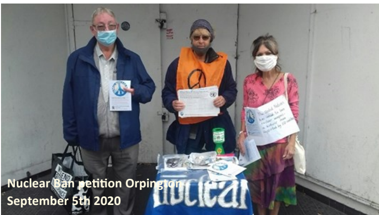
Nuclear Ban petition Orpington September 5th 2020

The recording of the SE London CND Peace Coalition Peace One Day event can be seen on you tube if you google Peace One Day. https://www.youtube.com/watch?v=BQUL3JRg820&t=22s