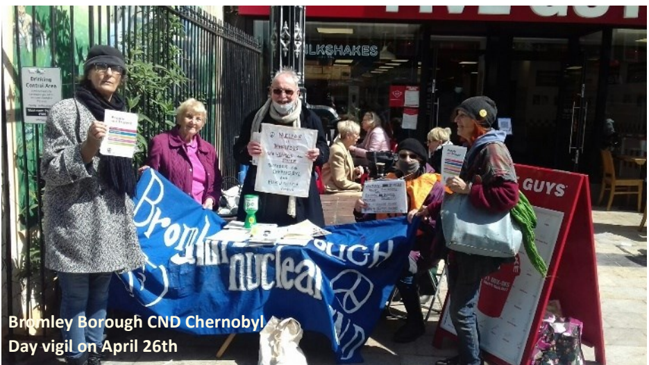
Bromley Borough CND Chernobyl Day vigil on April 26th

UAE already has nuclear power: both Egypt and Saudi Arabia are interested.