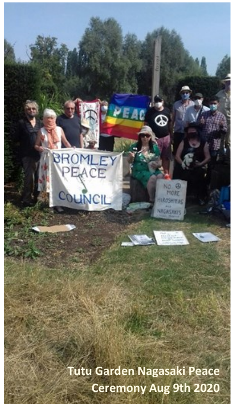
Tutu Garden Nagasaki Peace Ceremony Aug 9th 2020

For traditional socialists, such weapons could be banned only by parliament; our priority was converting the Labour Party to 'unilateralism'. Pacifist groups gave qualified support, including the Peace Pledge Union, Quakers, and the Fellowship of Reconciliation. Some hesitated; why specify nuclear